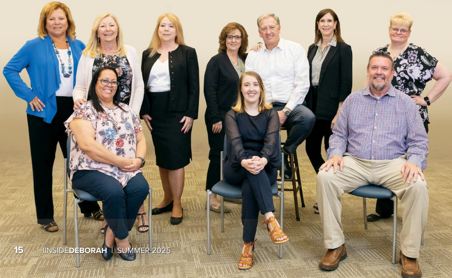
The Deborah Hospital Foundation team

Deborah Hospital Foundation is a shining example of how a dedicated team can transform lives through the power of philanthropy.